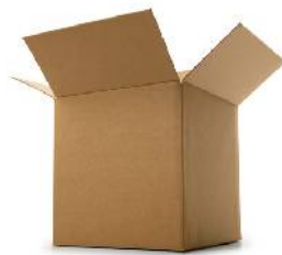
A box like Denzil